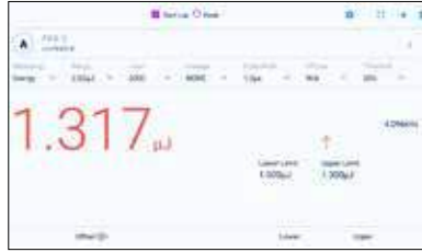
Pass/Fail screen. Excellent for QA purposes.