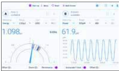
Two independent channels of measurement.