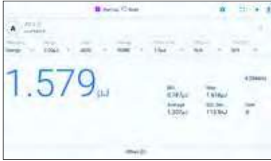
Display statistics of the present measurement session.