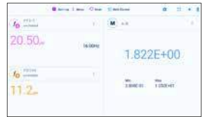
Two channels with a math comparison channel.