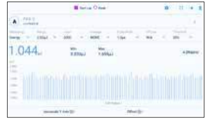
Pulse chart display of energy.