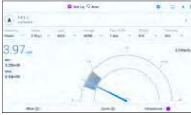
Analog needle display of power Persistence and min/max tracking.