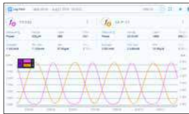
Two channels merging into one graph.