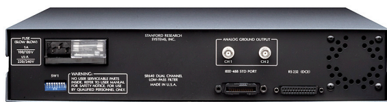
SR640 rear panel