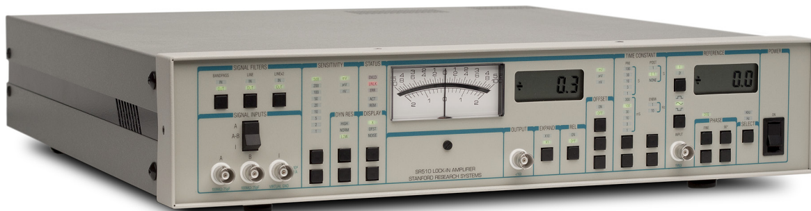
SR510 Lock-In Amplifier

An optional internal voltage-controlled oscillator provides both an adjustable-amplitude sine wave output and a synchronous, fixed-amplitude reference output. The sine wave amplitude can be set to 0.01, 0.1 or 1 V rms , and can drive up to 20 mA. The oscillator frequency is controlled by a rear-panel voltage input and can be adjusted between 1 Hz and 100 kHz. Typically, the sine wave output is used to excite some aspect of an experiment, while the reference output provides a frequency reference to the lock-in.