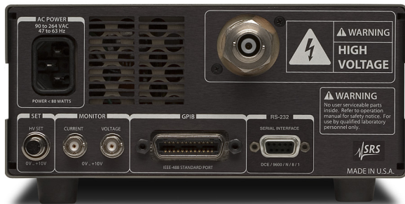
PS370 rear panel

Both GPIB and RS-232 computer interfaces are standard on all 10 W supplies. GPIB is available as an option on the 25 W instruments. All parameters can be set and read via the computer interfaces.