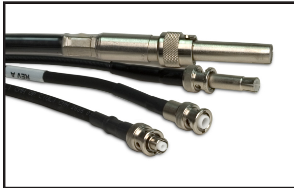
High voltage cables

The PS300 Series High Voltage Power Supplies are as useful in the R&D lab as they are in automated test applications. Wherever you are using them, the PS300 Series provide proven reliability and performance at a very affordable price.