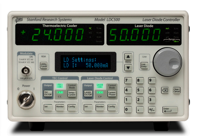
LDC500 front panel

The LDC500 series offers an auto-tuning feature which automatically optimizes the PID loop parameters of the controller. Of course, full manual control is provided too. Dynamic transfer between CT and CC modes for the TEC is also easy — just press the Temp/Current button.